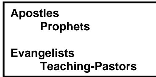
Figure 4. The Offices Given to the Local Assemblies of Body Saints

First, the first group of Apostles and Prophets are classified as such because they “require” charismatic empowerment, and are no longer in existence today. 6 The “apostle” was an office commissioned by Paul himself for the express purpose of forming local Body assemblies, defending the faith, and representing Paul as his legate. Examples, of members of the Pauline Apostleship are Timothy, Silas, Titus, etc. Once Paul died, his apostleship ended. There is no such thing as apostolic succession. 7