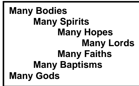
Figure 3. The Seven Manys of Israel's Earthly Kingdom Program

Something not yet discussed, but fundamental to the very notion of the Seven Ones is the backdrop to which Paul sets his One Body example in Ephesians 2. He defines the Body out of the Kingdom Program, which is made up of Jews and Gentiles (i.e., ethnic distinction). While the Body of Christ is one non-ethnic unit, the Earthly Kingdom Program is made up of many ethnic units. We shall see that this is the fundamental algorithm that correlates the entire Body Program with that of Israel's earthly kingdom program. The following graphic, like that for the Body illustrates the "Seven Manys" of Israel's Kingdom Program.